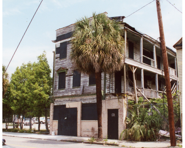
Historic Charleston Foundation was able to stretch the reach of its revolving fund by working with partners with related goals—Charleston Habitat for Humanity and the City of Charleston—on two house rehab projects.

A revolving fund requires funding which must be raised or earned on an ongoing basis to support the fund’s operation. The amount needed will depend on the number of staff members hired, the office space available, the equipment needed, the size of the area to be served (a statewide fund will require a larger travel budget, for example, than a neighborhood fund), and the number of projects to be