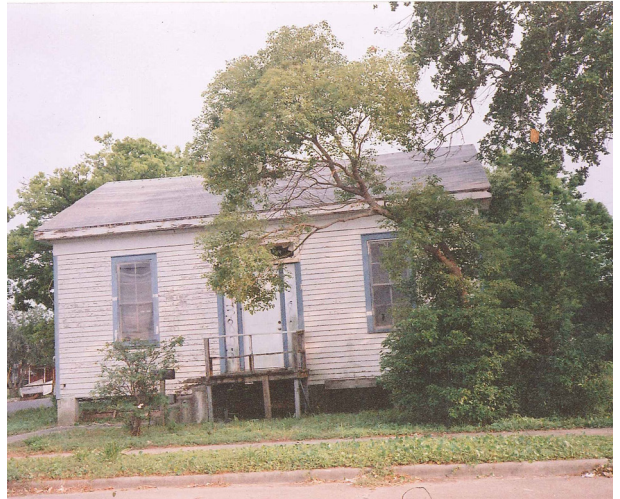
Galveston Historical Foundation (GHF) has used federal HOME Investment Partnerships Program funds to purchase and rehab three houses for low-income buyers or renters, including 3801 Winnie.

Although fee simple ownership is the most straightforward approach to controlling property—and may be the only transaction a property owner is willing to consider—it also involves the most commitment, the greatest potential for risk, and the largest outlay of cash.