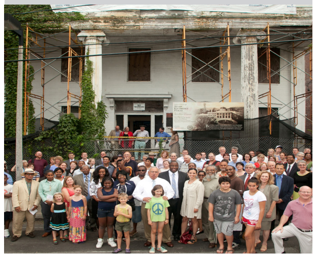
Historic Boston redeveloped the historic Alvah Kittredge House (1836) in Roxbury for market-rate and affordable housing.

Taking appropriate security measures to protect a vacant structure can be the most important cost savings and public relations tool available to a revolving fund. Vacant buildings are easy targets for arsonists and vagrants who seek shelter and accidentally (or intentionally) start fires. If not properly boarded or fenced, vacant buildings also pose hazards to neighborhood children and residents. The organization should adequately secure the site to prevent damage to people or property. Fund managers should arrange for periodic building inspections and notify the police department to