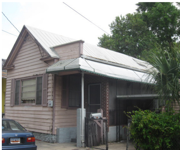
Historic Charleston Foundation (HCF) has operated a revolving fund since 1957. HCF used its fund to restore the facade and piazza of this small "Freedman's Cottage" in 2012.

Some revolving funds begin and continue building over the years by accepting donations of real estate, which are then sold and the proceeds used for future acquisitions. Properties may be donated outright by individuals who want to preserve their property, reduce estate and inheritance taxes, or obtain a charitable contribution deduction for the fair market value of the property. Properties also may be conveyed with conditions. The donor may want to retain a life estate, which allows the donor to remain in the property for the rest of his or her life. A retained life estate is a good tool to use when an organization knows that it wants to acquire a given property in the future, but it may be decades before the organization receives the property. The organization should periodically monitor the property to ensure that the owner continues to care for/maintain the property. Another method is a bargain sale arrangement, where the property is sold to a revolving fund at less than its fair market value and the seller benefits from a charitable contribution deduction for the difference between the bargain sale price and the