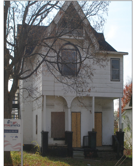
In a partnership with the program Restore America: A Salute to Preservation, a collaboration between the National Trust for Historic Preservation and Home & Garden Television, Knox Heritage used its Endangered Properties Fund to restore 1618 Washington Avenue in 2007.

As noted, an organization should develop clear guidelines for project eligibility based on the overall mission and objectives