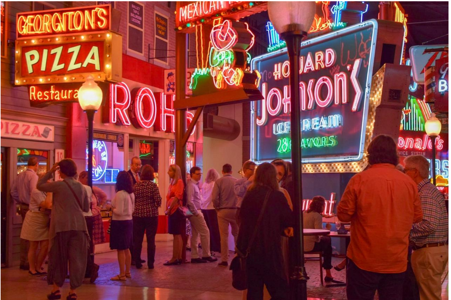
ABOVE: Partners Network members tour the American Sign Museum in Cincinnati, Ohio, at the Partners Network Spring Meeting, April 2018.