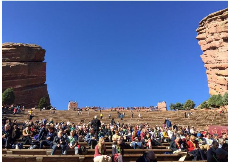
Partners gathered from all over the country in Denver for the Fall Meeting, which was held in collaboration with PastForward in October 2019. We were treated to a special morning at Red Rocks Park and Amphitheatre for the closing plenary.