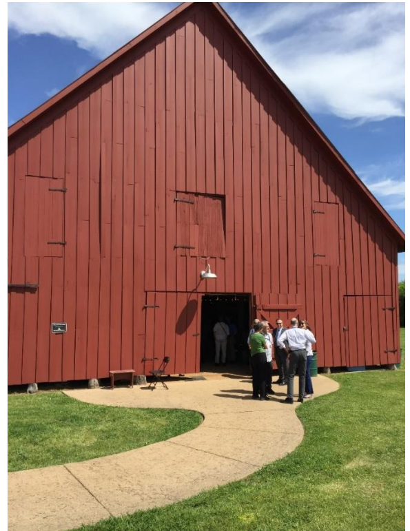
Partners gather in April 2019, before a lunch in the restored barn at the Opal Lawrence Historical Park in Mesquite, Texas. Historic Mesquite, Inc., is headquartered in the park, at the Noah Range Farmhouse.

In 2015, discussions began on forming a new independent organization based on the Statewide and Local Partners Program model. It became apparent that the number, capacity, and strength of the individual partner organizations had grown and that the preservation community would be well-served by an independent organization of peers that could directly design and deliver needed programs and services, foster communication, and promote collective advocacy. At the 2017 Spring Meeting in Seattle, a new structure for a partners network debuted, the National Preservation Partners Network. From there the organization grew, was officially incorporated on July 1, 2018, and awarded 501(c)(3) certification by the Internal Revenue Service on July 3, 2019. This collaborative effort of supporting all preservation organizations increases efficiency and strengthens both members and the larger preservation movement. Our network of partners shares the beliefs and principles that preservation is about preserving places that consider, represent, and engage this diverse nation.